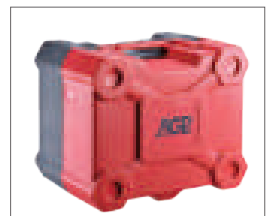
f Blow Molded Case