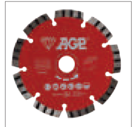
a Diamond Saw Blade (Universal)