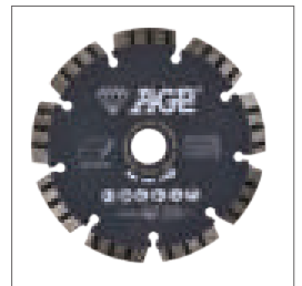
b Diamond Saw Blade (Hard Material)